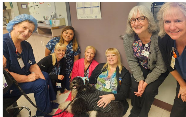
Pet therapy visits to units during Nursing Week