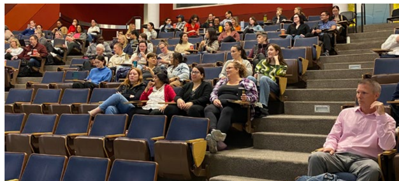
Nursing Prevalence Education Day October 2024

By continuously measuring and acting on these insights, TOH fosters a culture of data-driven decision-making, ensuring nurses have the tools and support to deliver safe, high-quality and compassionate care.